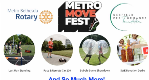
And So Much More!